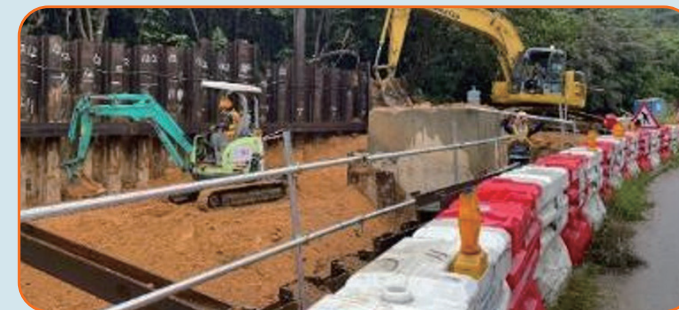
東涌道北道路擴闊工程 Road widening works at Tung Chung Road North

Widening works of Tung Chung Road North are on-going. Excavation works for retaining wall construction are in progress.