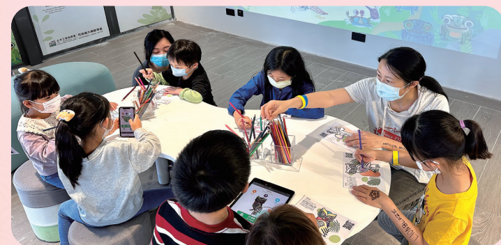
互動繪畫及遊戲區「大嶼繽紛世界」 Interactive drawing cum gaming area "Wonderful Lantau"

由舊有工地寫字樓活化而建成的東涌社區聯絡中心新翼亦與東涌東海濱長廊同時揭幕。新翼設有生物多樣性互動繪畫及遊戲區「大嶼繽紛世界」，及設有「大嶼百科世界」展覽。藉此，市民可更容易了解獲大嶼山保育基金所資助的保育項目。