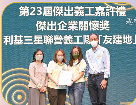
The Volunteer Team "Builder" won 3 awards

除了工程項目獲獎，義工隊「友建地」亦獲得3個義工獎，包括香港聖公會福利協會有限公司舉辦的第二十三屆傑出義工嘉許禮中獲得「傑出企業關懷獎」，義務工作發展局舉辦的香港義工獎2022中獲得「傑出協作計劃」及社區投資共享基金舉辦的社會資本動力獎2022中獲得「社會資本卓越夥伴獎（企業/機構）」。