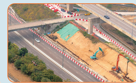
北大嶼山公路旁的擋土牆工程 Retaining wall construction along North Lantau Highway