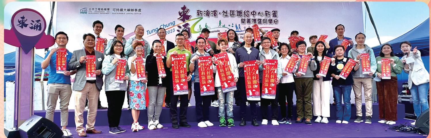
東涌東海濱及東涌社區聯絡中心新翼開幕禮 Opening ceremony of Tung Chung East Promenade and Tung Chung Community Liaison Centre Extension

The fun days were held on 14 and 15 January 2023 at the Tung Chung East Promenade. There were various kinds of activities, such as music and dance show, face painting, Fai Chun writing, STEM workshop and family yoga, etc.