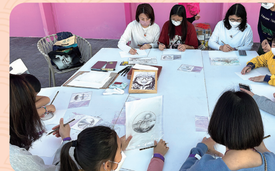
漫畫風景繪畫工作坊 Comic Landscape Drawing Workshop