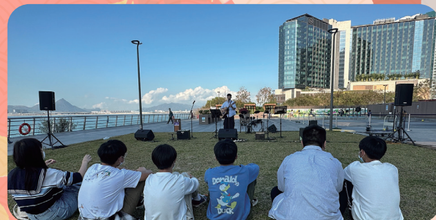
市民在海濱長廊欣賞歌唱表演 The public enjoyed the busking performing at the promenade