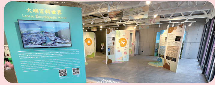
「大嶼百科世界」進行大嶼山保育基金項目展覽 Lantau Conservation Fund Exhibition at "Encyclopedic World of Lantau"

Tung Chung Community Liaison Centre (CLC) Extension, which was constructed through renovation and modification of a disused site office, was opened on the same time together with the new promenade. The CLC Extension consists of interactive drawing cum gaming area "Wonderful Lantau" for learning about the bio-diversity in Lantau. Also, there is a themed exhibition area named "Encyclopedic World of Lantau" introducing the conservation projects subsidized by the Lantau Conservation Fund.