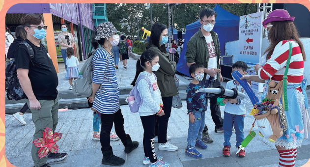
市民參與同樂日舉辦的精彩活動包括扭波波及踩高蹺 Public members participated in the funny activities, such as balloon twisting and walk on stilts on Fun Days