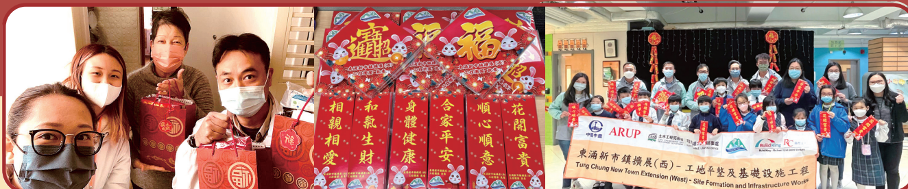
向東涌區內不同社區機構派發賀年揮春 Distribute Fai Chun to community organizations of Tung Chung

To celebrate the Lunar New Year, the volunteer teams "Builder" and "Tung Chung West Project Team" distributed Fai Chun prepared by the project team to the community organizations, nearby residents in Tung Chung and Tung Chung Rural Committee in January 2023 to wish them a healthy, joyful and prosperous Year of the Rabbit.