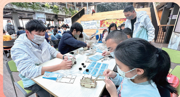
小朋友在STEM工作坊學習製作裝載車模型 Children learnt how to make loader model in STEM workshop