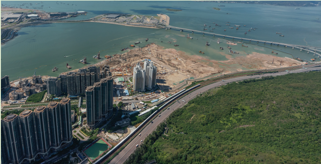
迎東邨對出的填海工程 Reclamation works outside Ying Tung Estate

Placing of fill materials (including sand blanket and public fill), deep cement mixing works and drainage works are in progress.