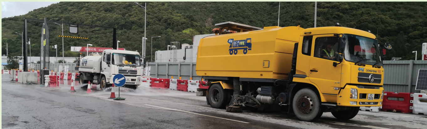
機動掃街車和灑水車 Mechanical sweeper vehicle and water truck

Besides implementing works of the project, taking care of residents nearby our site is of equal importance. In order to enhance the living environment of the residents nearby, we deployed mechanical sweeper vehicles and water trucks to clean the public roads regularly in the vicinity of our site. The mechanical sweeper vehicles sweep away dust and dirt on streets effectively and make the streets clean. Following the mechanical sweeper vehicles, water trucks are deployed to wash the surrounding streets for suppressing dust.