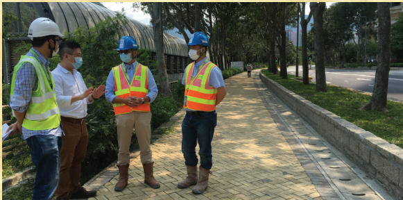
向離島區區議員講解文東路工程 Briefing the Islands District Council member on road works at Man Tung Road