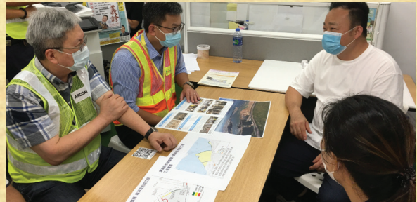
向離島區區議員講解工程進展 Briefing the Islands District Council member on works progress