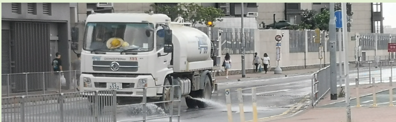
灑水車清洗街道 Cleaning public road by water truck