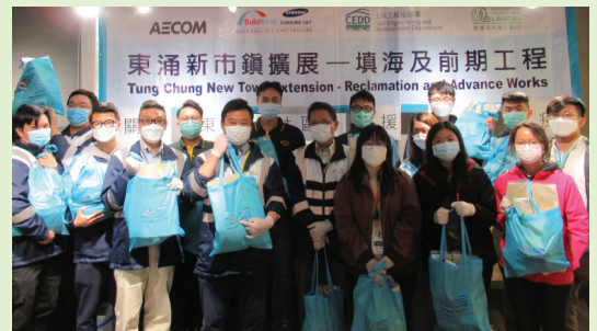
「友建地」義工隊向東涌長者及少數族裔社群送上抗疫包 Distributing caring bags to the elderly and ethnic minorities in Tung Chung by the volunteer team "Builder"