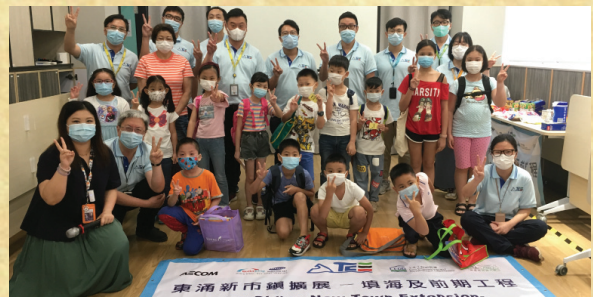
為有需要的小朋友在復課前提供學習上的支援及講解建築工地的安全知識 Providing learning support before class resumption and introducing construction site safety to children in need