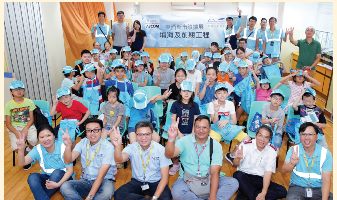
舉辦小學生講座 School Talk for primary students