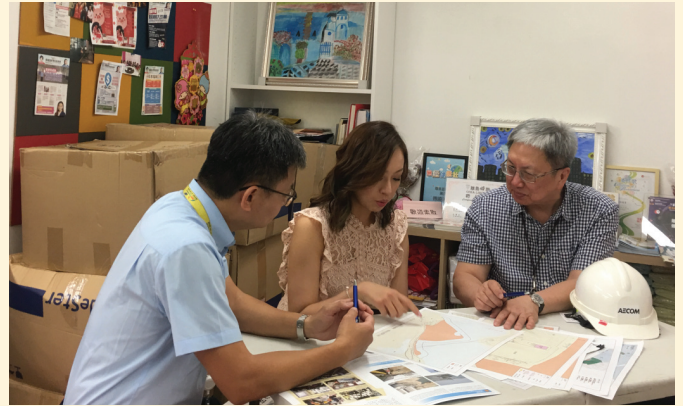
向離島區議員講解工程最新進度 Brief on the latest progress of works to the Islands District Council member