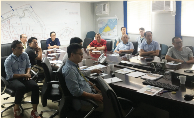
定期與梅窩鄉事委員會進行聯絡會議 Regular Liaison Meetings with Mui Wo Rural Committee

In the past three months, the project team organised various activities with an aim to engage the communities in Tung Chung area. The main theme of the activities includes waste reduction, education and promotion, care for the underprivileged, etc. In addition, to echo the mooncake box recycling scheme in Ying Tung Estate organised by the Housing Department, the project team joined forces to collect mooncake boxes actively in order to build a greener community.