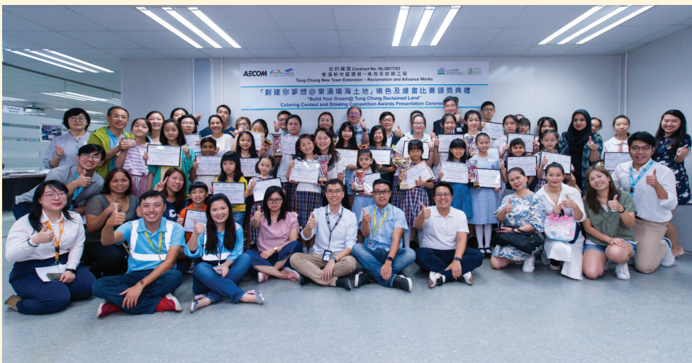
「創建你夢想@東涌填海土地」填色及繪畫比賽頒獎典禮 “Build Your Dream@Tung Chung Reclaimed Land” Colouring Contest and Drawing Competition Awards Presentation Ceremony