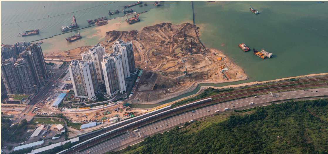
迎東邨對出的填海工程 Reclamation works outside Ying Tung Estate

Placing of fill materials (including sand blanket and public fill) and deep cement mixing works are in progress. Road and drainage works (Man Tung Road near the football field) will be completed by the end of year 2019.