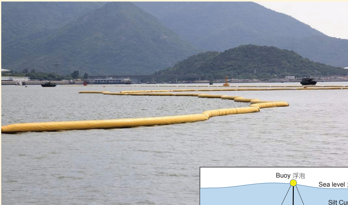
淤泥屏障 Silt curtains

Provision of silt curtain is one of the mitigation measures to prevent the water pollution in reclamation works. During the course of construction, silt curtains are installed at the periphery of the reclamation area in order to minimise the impact on water quality. Our staff conduct daily check of the condition of the installed silt curtains prior to works commencement, including its integrity and location, so as to ensure the silt curtains are installed properly and function effectively. Furthermore, our diving team inspects the underwater condition of silt curtains regularly. In case of any defects found, the project team will repair or replace silt curtains immediately in order to prevent water pollution.