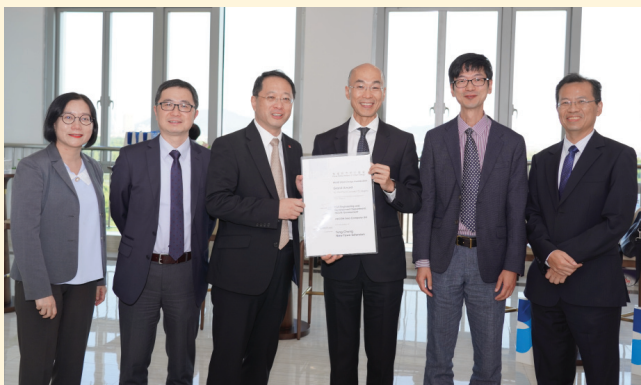
香港城市設計學會頒發獎狀予土木工程拓展署可持續大嶼辦事處代表 Hong Kong Institute of Urban Design presents the award to representatives of Sustainable Lantau Office, CEDD