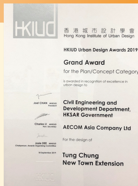
本工程獲香港城市設計學會頒發2019香港城市設計大獎 The project won the Grand Award of Hong Kong Institute of Urban Design Awards 2019