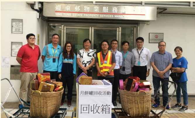
參與迎東邨月餅盒回收活動 Participation in mooncake box collection activity of Ying Tung Estate